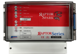
Raptor Spark™ Spark Detector (Infrared Sensor)